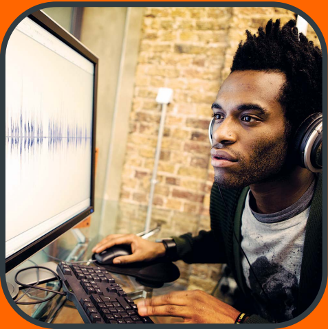
Digital Media (Software Development)

Greater New Orleans' economy is growing with three “ Diversifying ” industries.