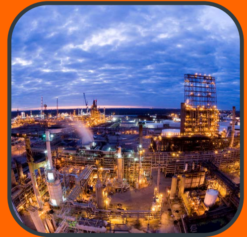
Energy (Oil and Natural Gas)