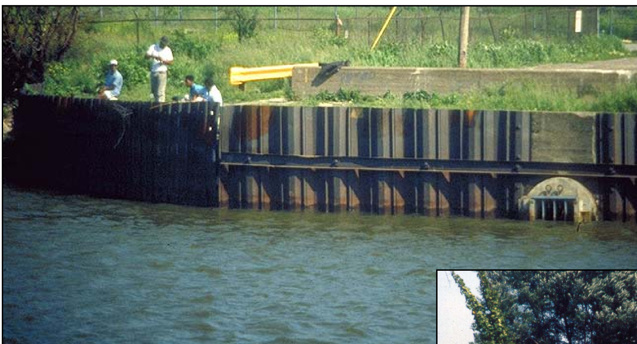
Figures above and right: Anglers fishing from the banks of the river adjacent to a CSO (round concrete opening with blue grate).

surrounding the Buffalo River include a high percentage of displaced steel workers, older residents, and less affluent neighborhoods.