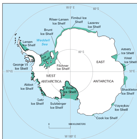
Figure 1. Index map to the principal geographic features of Antarctica, including the ice shelves where large coastal-change events commonly occur.

Ice fronts, iceberg tongues, and glacier tongues are the most dynamic and changeable features in the coastal regions of Antarctica. Floating ice margins are subject to frequent and large calving events or rapid flow. These situations lead to annual and decadal changes in the position of ice fronts on the order of