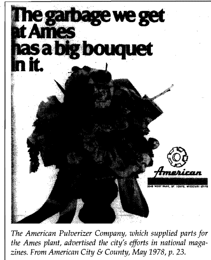
The American Pulverizer Company, which supplied parts for the Ames plant, advertised the city's efforts in national magazines. From American City & County , May 1978, p. 23.

the recovery process, the city built a paper recycling annex next to the plant. The paper was sold for up to $40 per ton or burned depending on the economic markets. 31